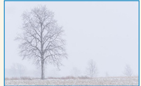
2nd Place Sue Olmstead