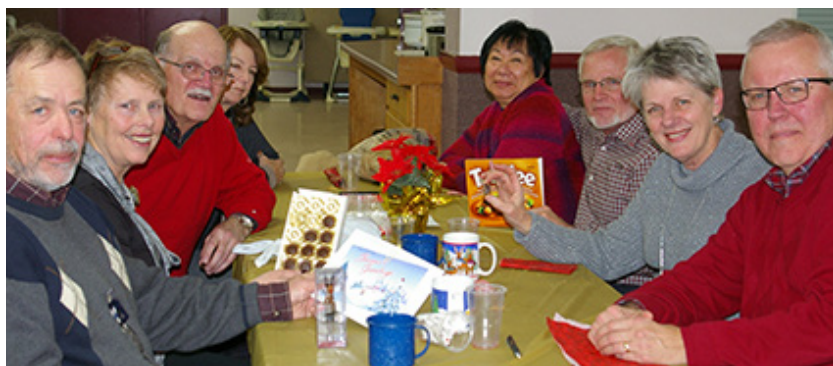
Winners: Congratulations on winning the 'Nicest or Worst' Christmas Gift Game