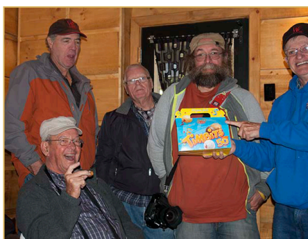
The end of a fun day!

Raptors that are netted on area farms are put on display and released from the back of a pickup truck. It was a great opportunity to get photos. If you are interested in following Hawk Cliff Hawkwatch on the Internet, check out both their web page and Facebook page.