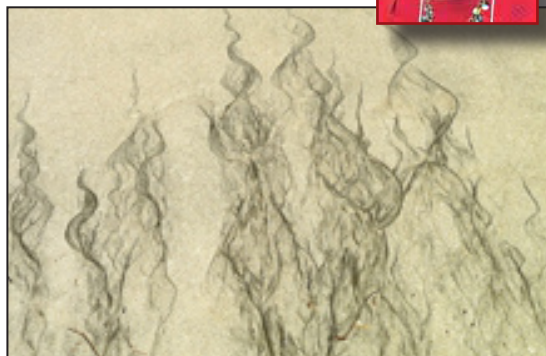
Wave Sketch in the Sand