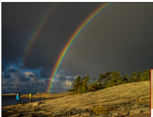
After the Storm