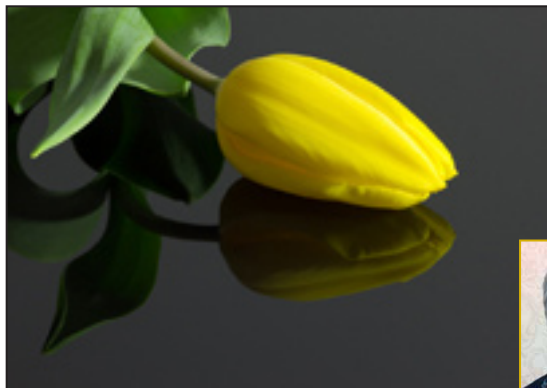
© Linda Feick Reflections of Spring