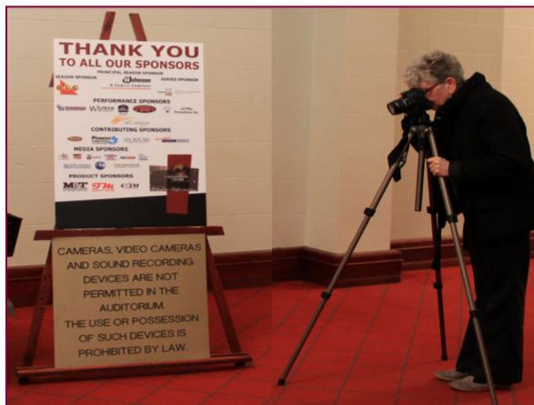
Sign read - no camera allowed